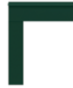
Decorative Drip Cap with 3 1/2" or 4 1/2" Flat, Forest Green