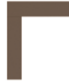
3 1/2" or 4 1/2" Flat, Terratone