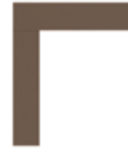
3 1/2" or 4 1/2" Flat, Terratone