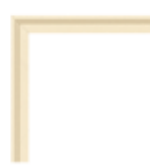
2" Brick Mould, Canvas