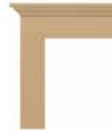
2" Cornice Head with 3 1/2" or 4 1/2" Flat, Prairie Grass