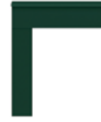
Decorative Drip Cap with 3 1/2" or 4 1/2" Flat, Forest Green