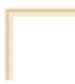
2" Brick Mould, Canvas