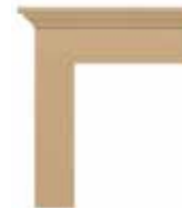
2" Cornice Head with 3 1/2" or 4 1/2" Flat, Prairie Grass