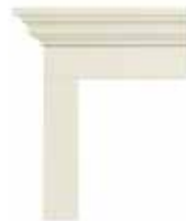
3 5/8" Cornice Head with 3 1/2" or 4 1/2" Flat, White